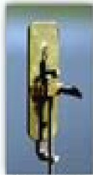
Antonie van Leeuwenhoek

Developed the microscope with single lens