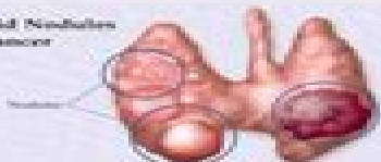
Nodule and Cancer

Thyroid nodules: An abnormal growth of thyroid cells in the thyroid gland. Most nodules are benign (not cancerous) and do not cause any symptoms. Some nodules can cause symptoms, such as a lump in the neck or a change in the voice. Some nodules can also cause hyperthyroidism.