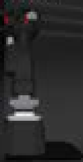
AVIA [.] HORNET