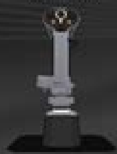
AVIA [.] SOL W