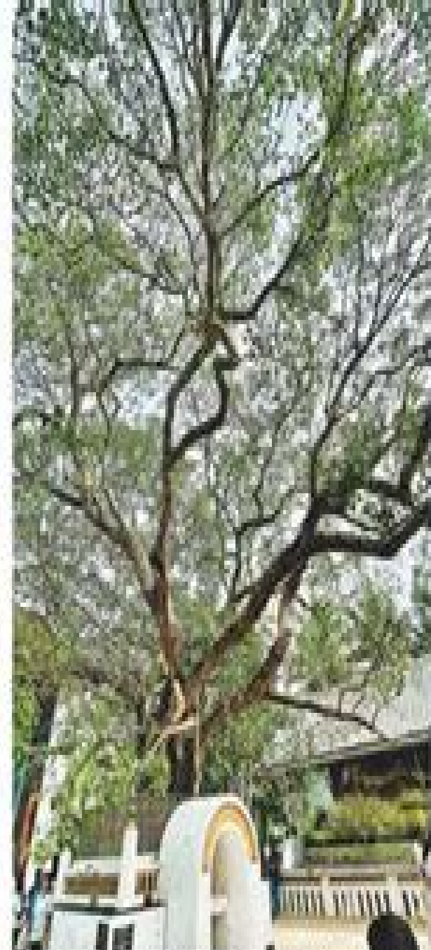
Jaya Sri Maha Bodhi tree, Sri Lanka