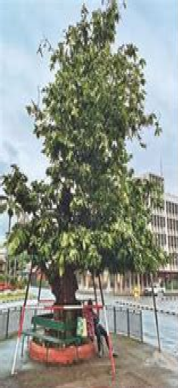
Ivi tree, Fiji