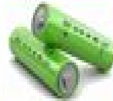
Nickel-metal hydride battery