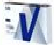
Cobalt-free lithium battery