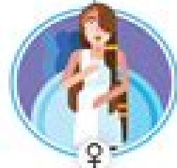
APHRODITE Goddess of love, beauty, and fertility