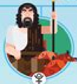
HADES God of the underworld