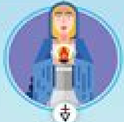
HESTIA Goddess of the hearth, architecture, domesticity, the family, the home, and the state