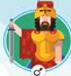
ARES God of war