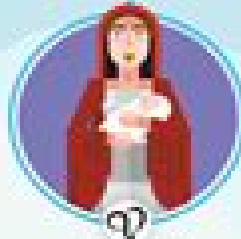
EILEITHYIA Goddess of childbirth