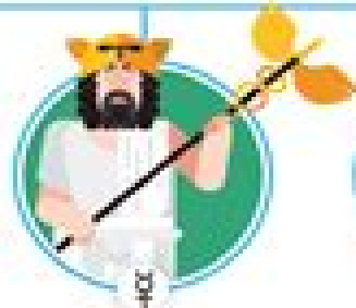
HERMES God of trade, wealth, luck, fertility, animal husbandry, sleep, language, thieves, and travel