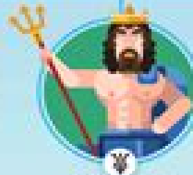
POSEIDON God of the sea