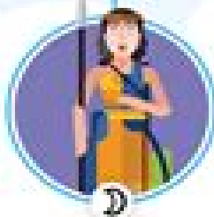
ARTEMIS Goddess of the hunt, wilderness, and wild animals