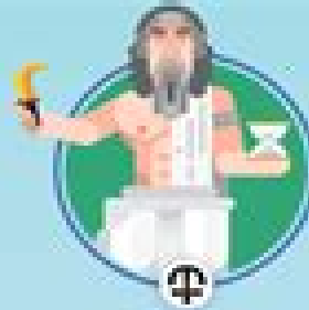
KRONOS God of time and ages Turned a nut against his own children