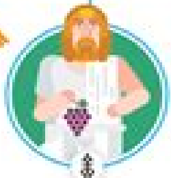
DIONYSUS God of the grape harvest, winemaking, and wine