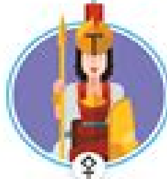
ATHENA Goddess of wisdom and military victory