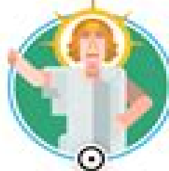
APOLLO God of music, truth, and prophecy