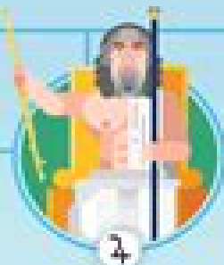
ZEUS God of the sky, lightning, and thunder