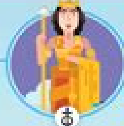
HERA Goddess of marriage and family