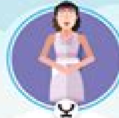
HEBE Goddess of youth