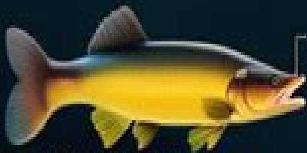
DAV SMALLER'S HIAF RYNDOMH

Small text below the fish illustration, likely a description or name.