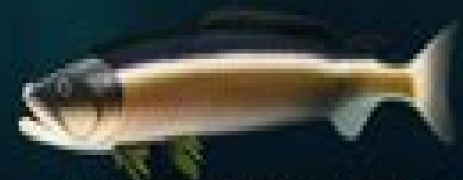
DAV DAV REYDOD BARETT BARKO DAVEN FYNCE