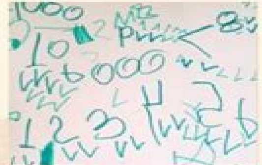
Letter-Like Forms Stage (Ages 3-5)