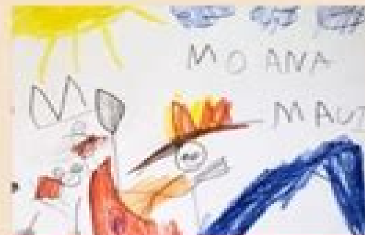
Conventional Writing Stage (Ages 5-7)