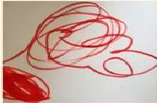
Scribbling Stage (Ages 1-3)