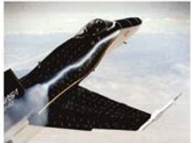
Smoke and Tufts