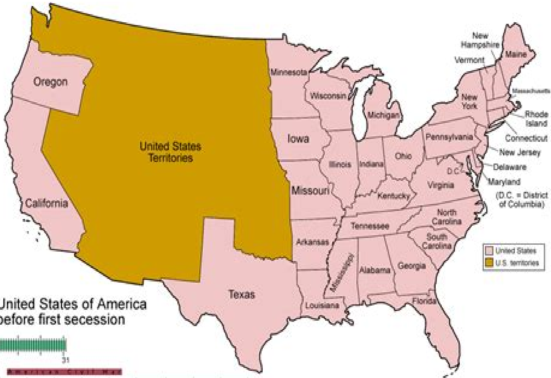
United States of America before first secession