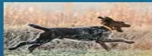
6. GERMAN WIREHAISED POINTERS