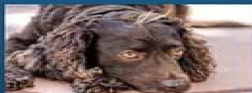
9. AMERICAN WATER SPANIELS