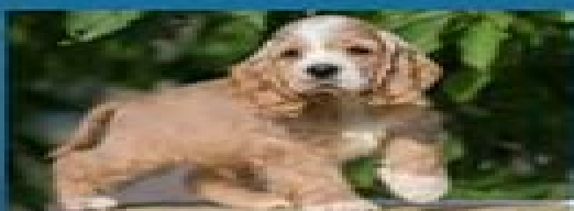
5. American Cocker Spaniels