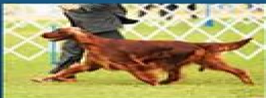
7. IRISH SETTERS