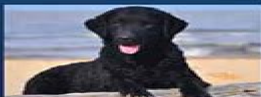
12. CURLY-COATED RETRIEVERS