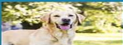
1. LABRADOR RETRIEVERS