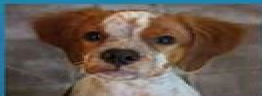
2. BRITTANY SPANIELS