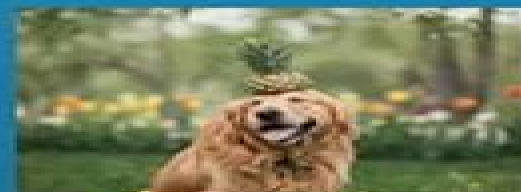
3. GOLDEN RETRIEVERS