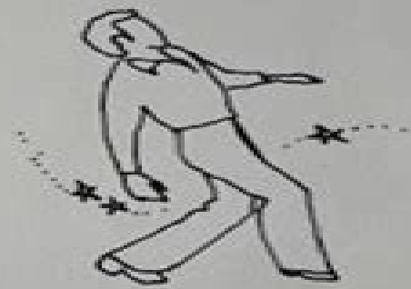
DIP RIGHT (7)