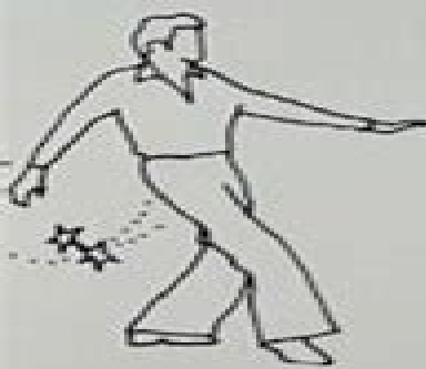
START FRONT (1)