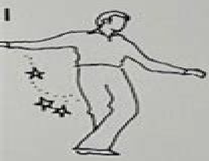
DIP LEFT (5)