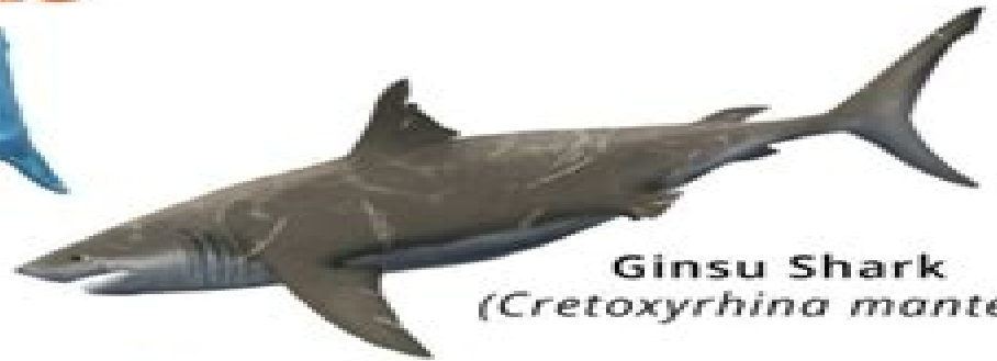
Ginsu Shark (Cretoxyrhina mantelli)