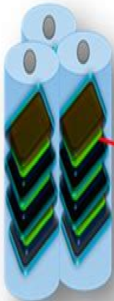
Water Purification Device (WPD)