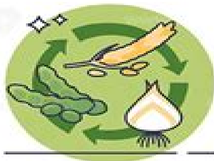
PRACTICING CROP ROTATION