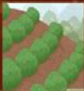
PLANT GRASS AND HERBS