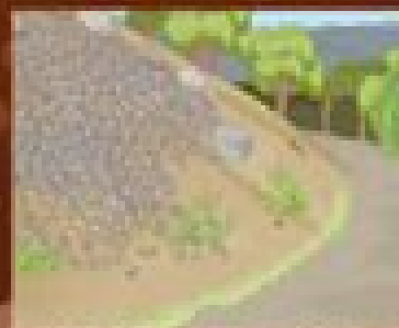
ADD MULCH OR ROCKS