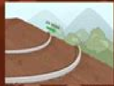
BUILD RETAINING WALLS