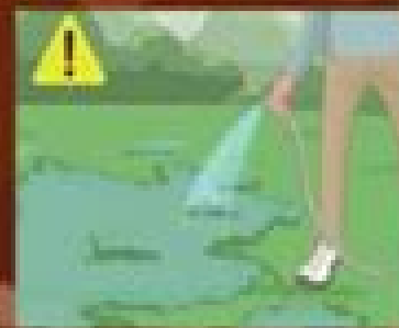
REDUCING WATER IF POSSIBLE