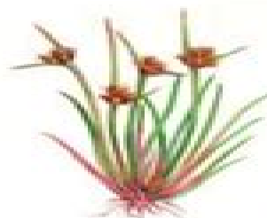
7. Dwarf Rush Juncus capitatus