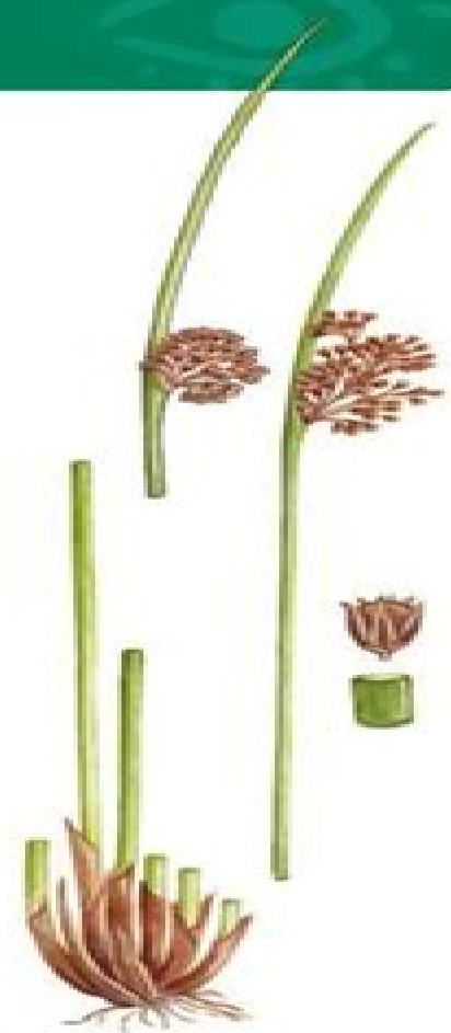
5. Soft Rush Juncus effusus