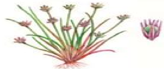
8. Pigmy Rush Juncus pygmaeus