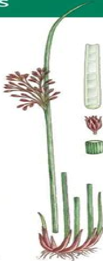
3. Hard Rush Juncus inflexus