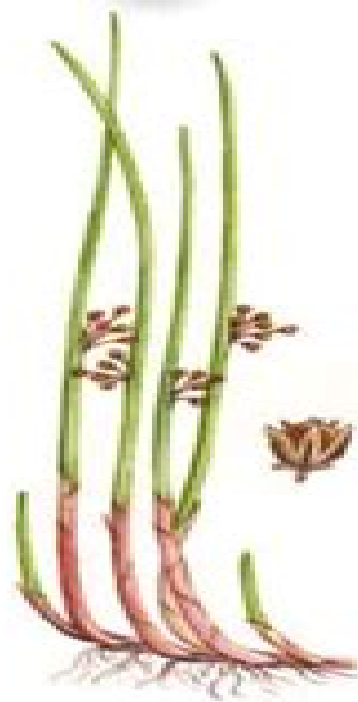
1. Thread Rush Juncus filiformis