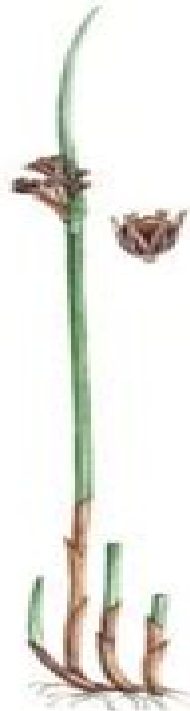
2. Baltic Rush Juncus balticus