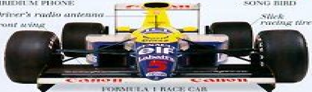
FORMULA 1 RACE CAR