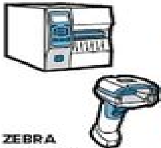
ZEBRA PRINTERS AND SCANNERS