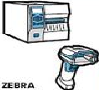
ZEBRA PRINTERS AND SCANNERS

Your Current Network of Mismatched Components Is Exposing You to Risk