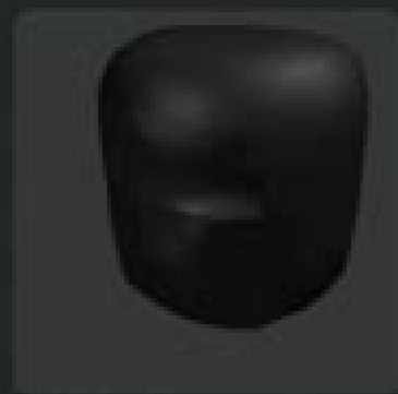
Ninja Mask of Shadows 12