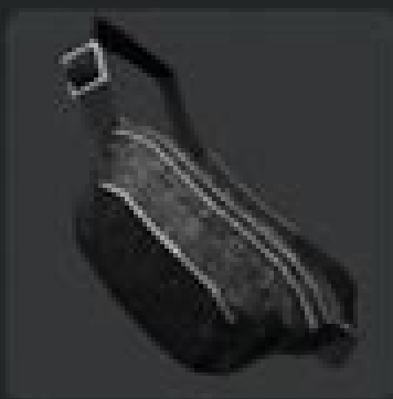
Black - Camo Crossbody Bag By Claw Studio 22