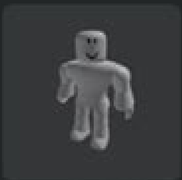
Robloxian 2.0 15