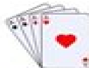
Playing with cards