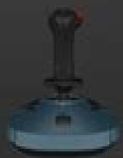
TCA SIDE STICK X PILOT