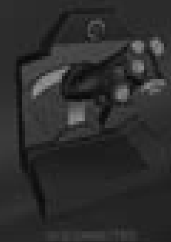
F-16C VIPER TD5