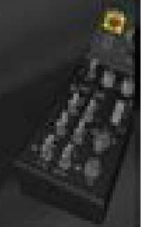
F-16C VIPER D