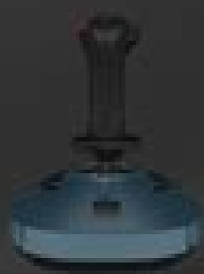
TCA SIDE STICK X COPILOT