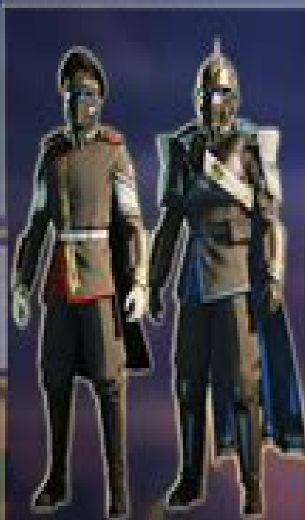
M-1043 PRAETOR CUTTHROAT