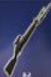
M-1000 ASSAULT RIFLE