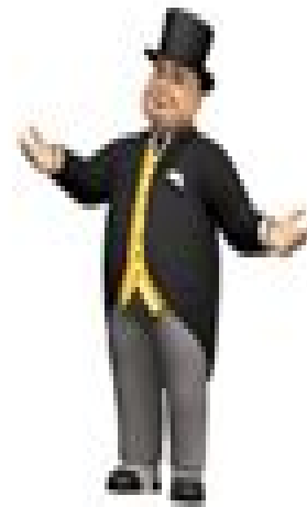
Sir Topham Hatt or the Fat Controller