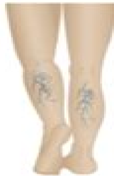
VARICOSE VEINS TRUNK