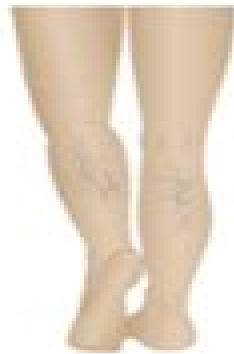
RETICULAR VARICOSE VEINS