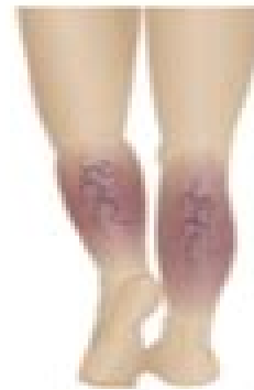
CHRONIC VENOUS INSUFFICIENCY