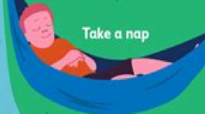
Take a nap