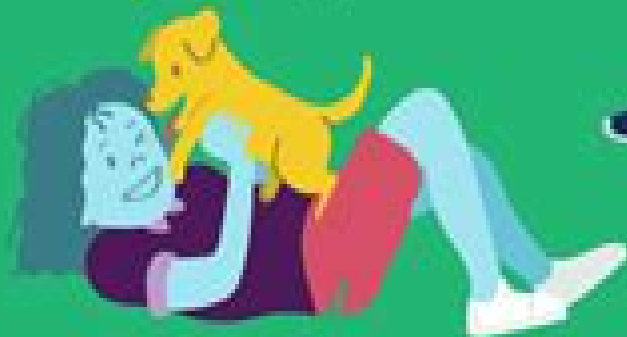
Play with a pet